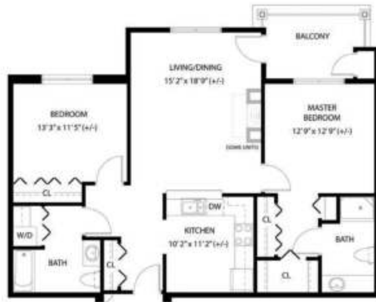
GOLDENBELL & GOLDENROD