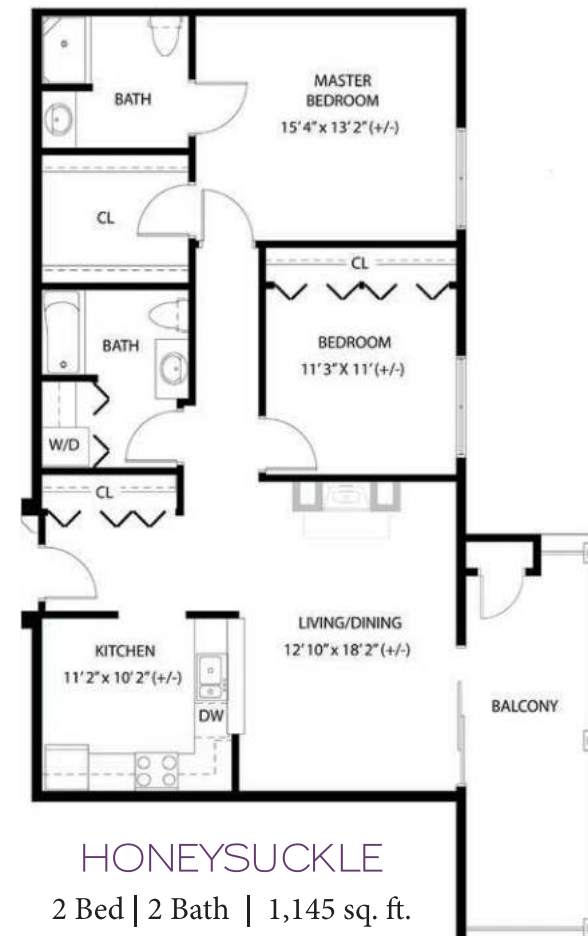
HONEYSUCKLE 2 Bed | 2 Bath | 1,145 sq. ft.