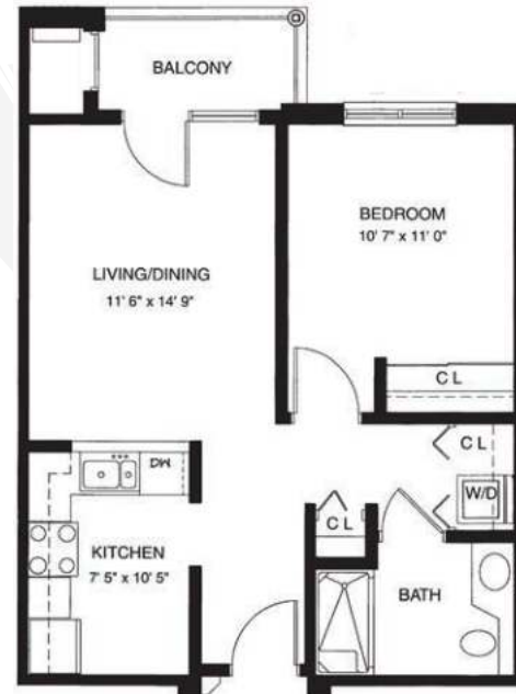
ASPEN 1 Bed | 1 Bath | 550 sq. ft.