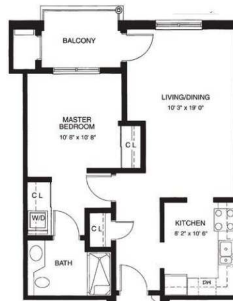
BAYBERRY 1 Bed | 1 Bath | 600 sq. ft.