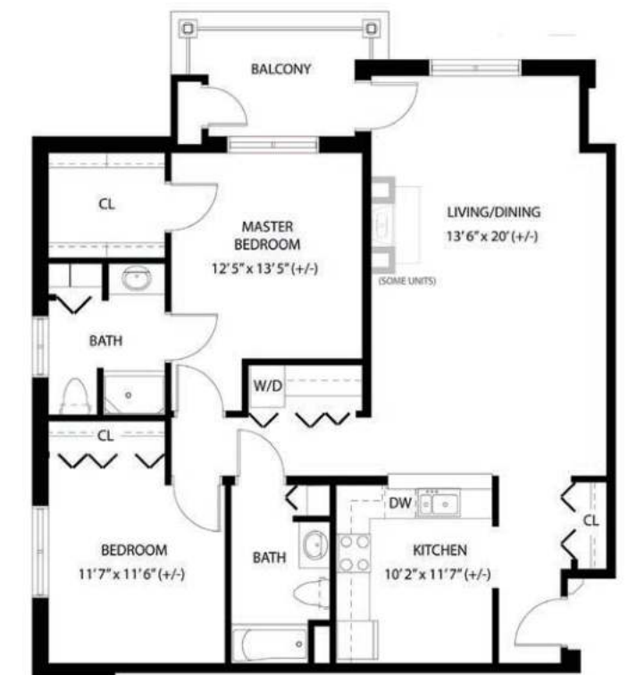
IVY 2 Bed | 2 Bath | 1,315 sq. ft.