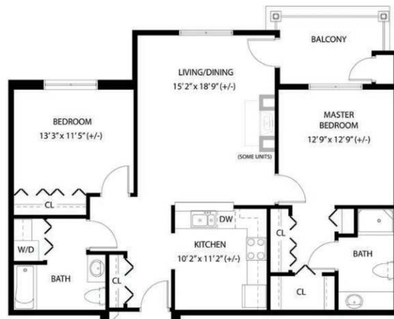
GOLDENBELL & GOLDENROD 2 Bed | 2 Bath | 1,160 sq. ft.