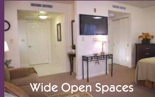
Wide Open Spaces