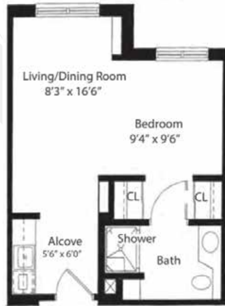
AZALEA Alcove / Studio | Private Bath 400 sq.ft