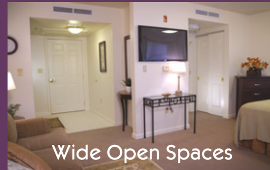
Wide Open Spaces