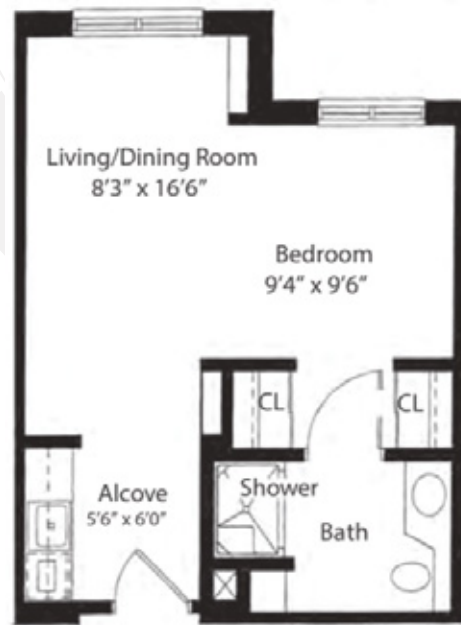
AZALEA Alcove / Studio | Private Bath 400 sq.ft