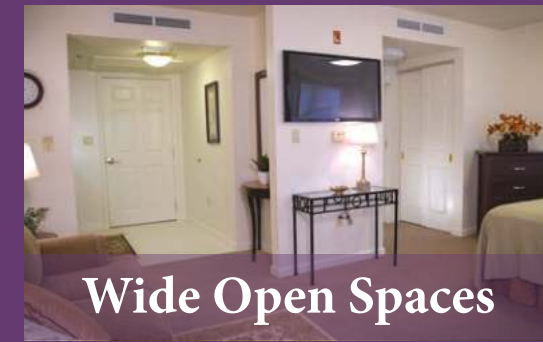
Wide Open Spaces