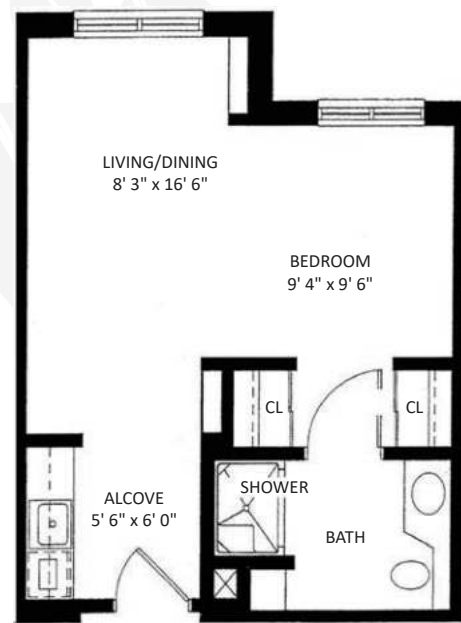
AZALEA Alcove / Studio | Private Bath 400 sq. ft.