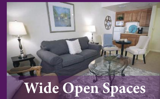
Wide Open Spaces