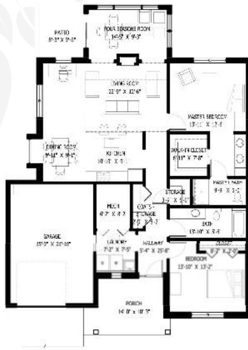
BEECHWOOD Duo Villa | 1,505 sq. ft. 2 Bed | 2 Bath | 1.5 Car Garage