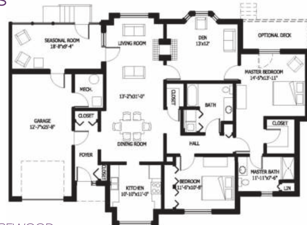
WILDWOOD Free Standing Villa 1,990 sq. ft. 2 Bed | Den | 2 Bath 1.5 Car Garage