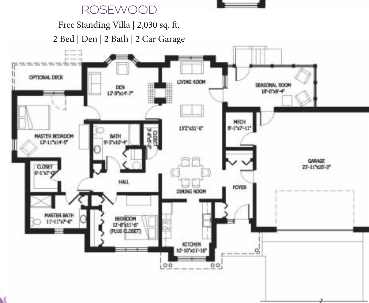
ROSEWOOD Free Standing Villa | 2,030 sq. ft. 2 Bed | Den | 2 Bath | 2 Car Garage