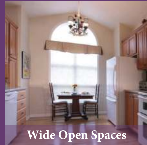
Wide Open Spaces