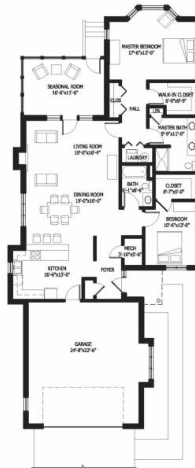
MAPLEWOOD Duo Villa | 1,890 sq. ft. 2 Bed | 2 Bath | 2 Car Garage